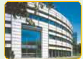
Fraunhofer ISE main building

The largest solar energy research institute world-wide has three major R&D topics: photovoltaics, energy efficient buildings, as well as hydrogen technology. View the institute premises, an exemplary energy-efficient solar building, and join a guided tour through the exhibition area.